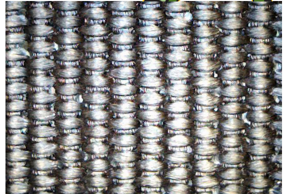
Microscopic view of COBRA™ filament threads and plain weave.